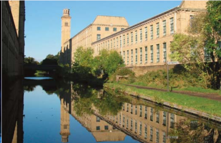
World Heritage site, Saltaire

Growing tourism in Lancashire & Yorkshire