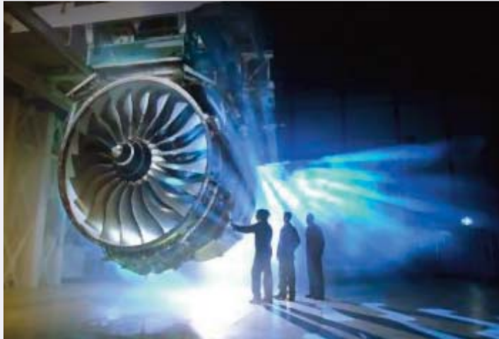
Aerospace industry: Rolls Royce in Barnoldswick