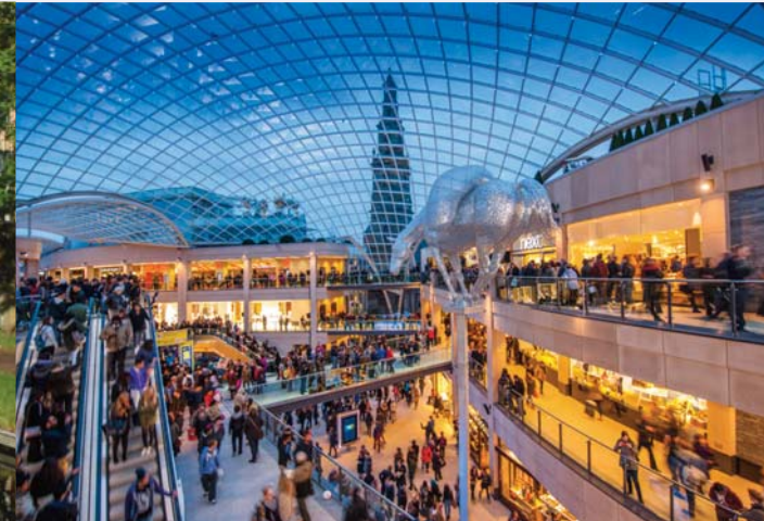
The Northern Powerhouse: Leeds city centre

Growing tourism in Lancashire & Yorkshire