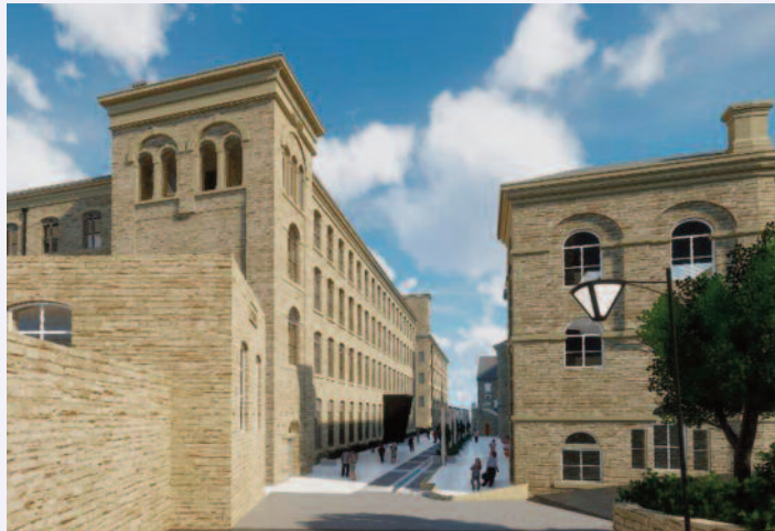
Northlight Mill, Brierfield: business, leisure & residential development

Stimulating regeneration, business and housing