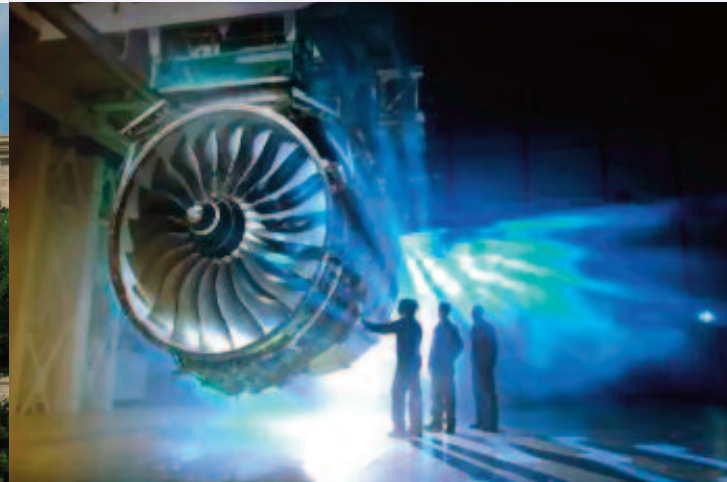
Aerospace industry: Rolls Royce in Barnoldswick

Stimulating regeneration, business and housing