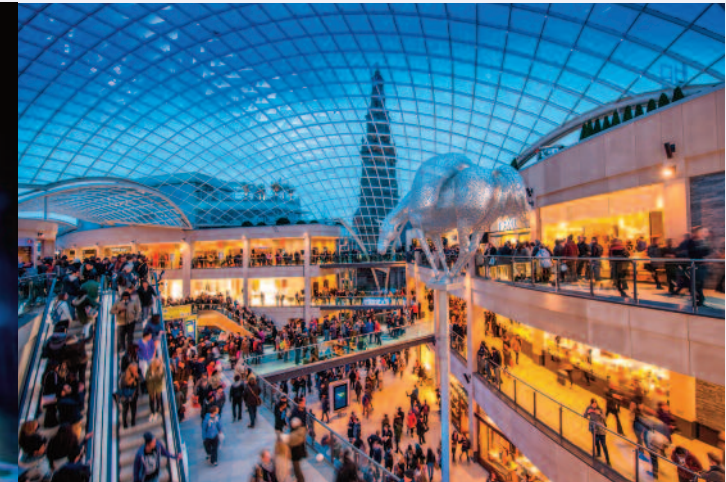
The Northern Powerhouse: Leeds city centre

Encouraging investment and economic growth